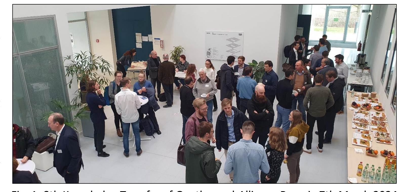
Fig. 1: 8th Knowledge Transfer of Geothermal-Alliance Bavaria 7th March 2024